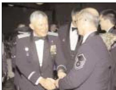
Space Command enlisted present CinC with Order of the Sword - Page 4