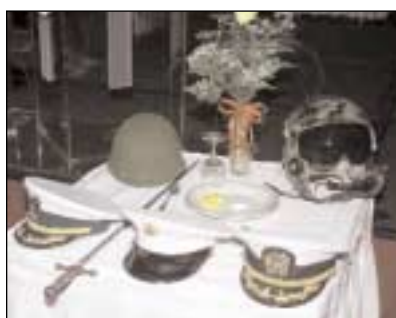
Air Force Ball attendees remember those who paved the way - Page 10