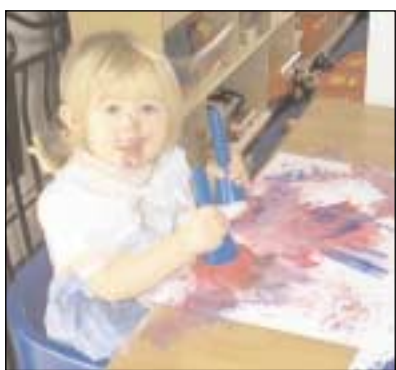
Air Force Program provides in-home care for Peterson's military family - Pages 8-9