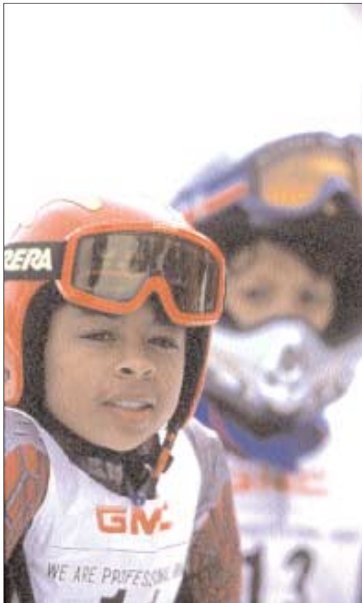
If you have the need for speed, ski and snowboard racing is available - but it isn't for the faint of heart!