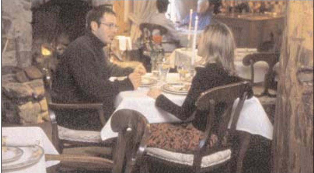
After a long day on the slopes you can enjoy a meal at one of Keystone's more than 30 restaurants. Meals range from as simple as pizza to an expensive four-star dinner.

Additional information on Rocky Mountain Blue can be found on the Internet at http://rockymountainblue.com or you may telephone them toll free at (866) RMT-BLUE, which is (866) 768-2583.