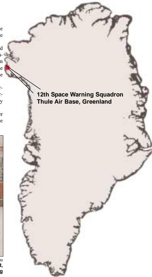
12th Space Warning Squadron Thule Air Base, Greenland

The unit is now gearing up for a December site visit by Gen. Ed Eberhart, Air Force Space Command commander.