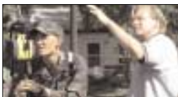
Local CE troops learn from city utility workers - Page 4