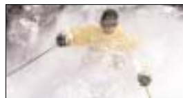
Rocky Mountain Blue offers affordable skiing to military - Page 8-9